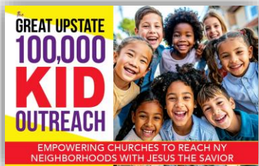
November GNC at Cedars of Chili